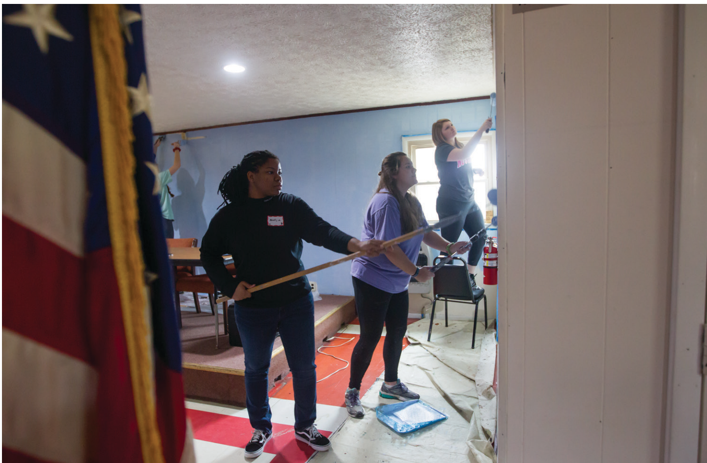
Volunteers freshen up a room at the Boone Veterans of Foreign War center.