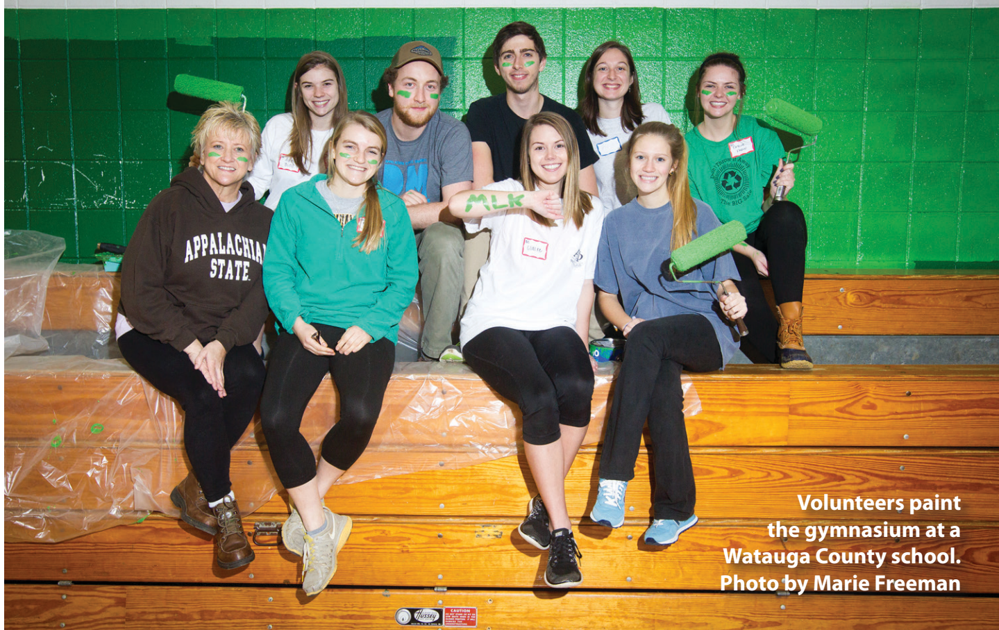
Volunteers paint the gymnasium at a Watauga County school.

At Appalachian, we put students first, always, and together we are building a bright future. Ultimately, the reason Appalachian's stellar faculty and staff come to work every day is to realize this vision.