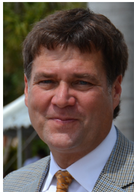
Bryan Haas Photo submitted