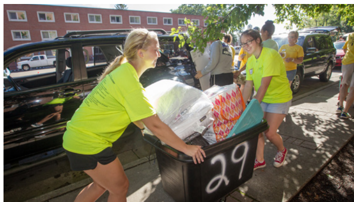
Students and families participate in move-in day on Aug. 12 at Appalachian State University.