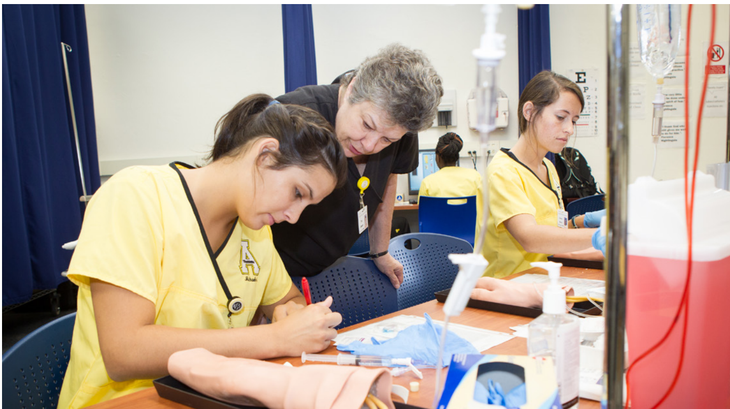
Nursing students in the Beaver College of Health Sciences.