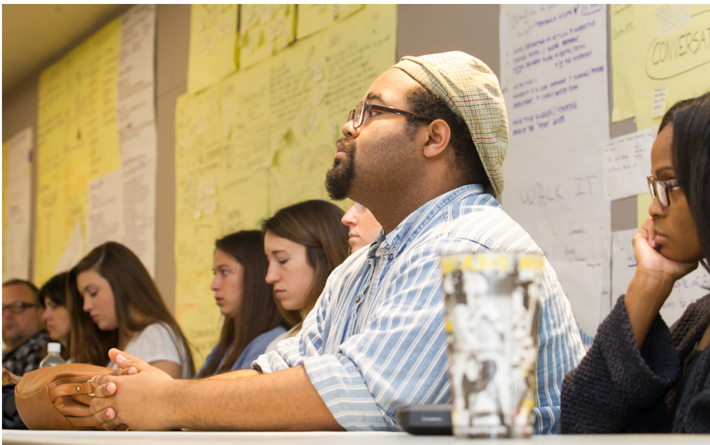
Students at AppLab, an interdisciplinary learning experience centered around finding sustainable and applicable solutions for challenges in the local community.

for our students, faculty and staff to engage in service, research and educational and economic development activities. Recently, we have scheduled two leadership breakfasts to encourage communication and partnerships and build relationships across the High Country. Guests will include representatives from the town councils of Boone and Blowing Rock, commissioners from Watauga, Ashe and Avery counties, local police departments, state and federal representatives and university leaders. And, in an effort to join the art communities of Blowing Rock and Boone, a shuttle service between BRAHM and the Turchin Center for the Visual Arts is available for free during major openings.