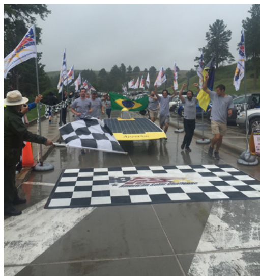
Team Sunergy's Apperion crosses the finish line of the American Solar Challenge in sixth place overall, and in second for the final stage of the 1,975-mile road race.