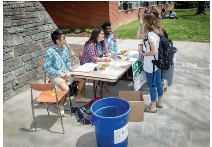
It was a perfect spring day for our Earth Day celebration on April 20. Students and clubs gathered on Sanford Mall with save the earth ideas and inspiration.