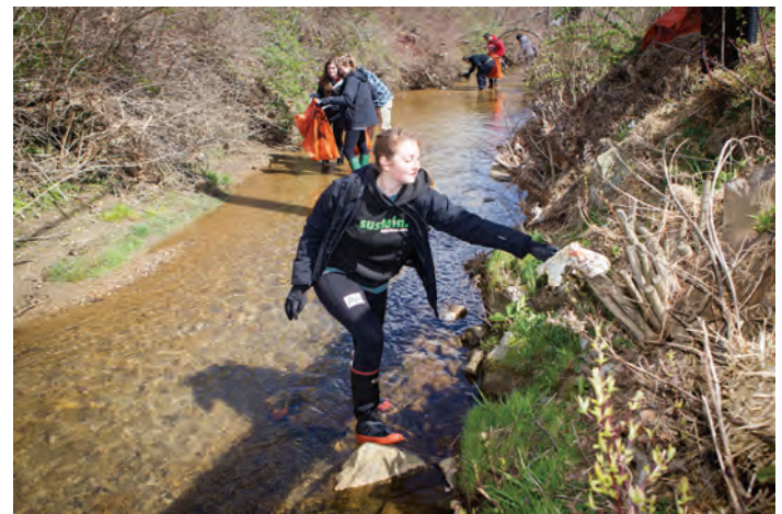
Several river clean-ups were scheduled around Boone during Earth Month.